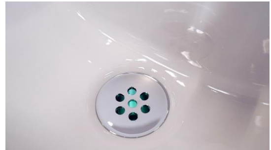
The light indicates that the UVC-irradiation is activated