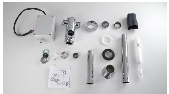
The UVC Water Trap Disinfector is delivered include fittings for all standards